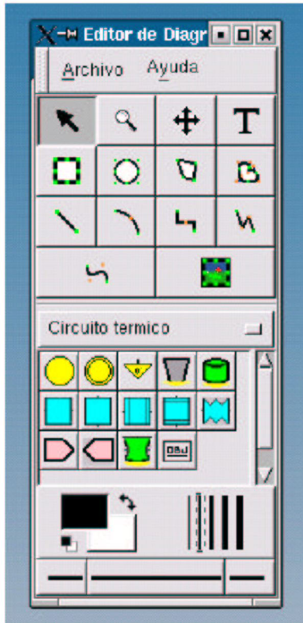
Figure 1: “Thermal circuit” sheet (“Circuito Termico”)

We designed a thermal circuit sheet with several shapes described in SVG format; and one more shape — a C-programmed one— borrowed from the UML sheet .